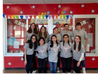
Pi day at SHSE, 2023 Rubin Award Winner