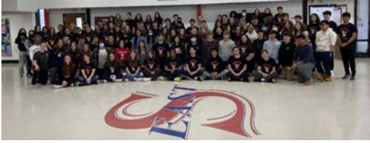
Smithtown High School East Saint James, New York!