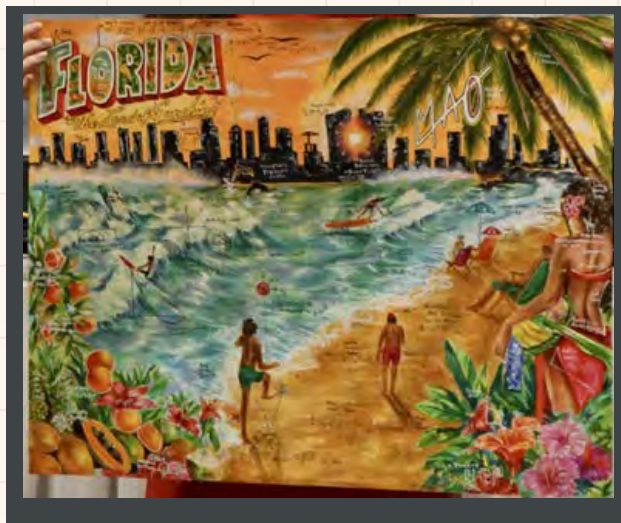
1 st Place American Heritage Broward