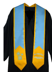
Honor Stole - $20