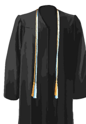
Honor Cords - $6