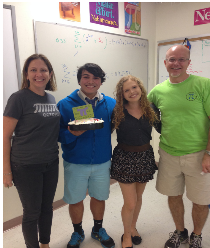
The above photos are from Saint Andrew's School in Boca Raton, FL.