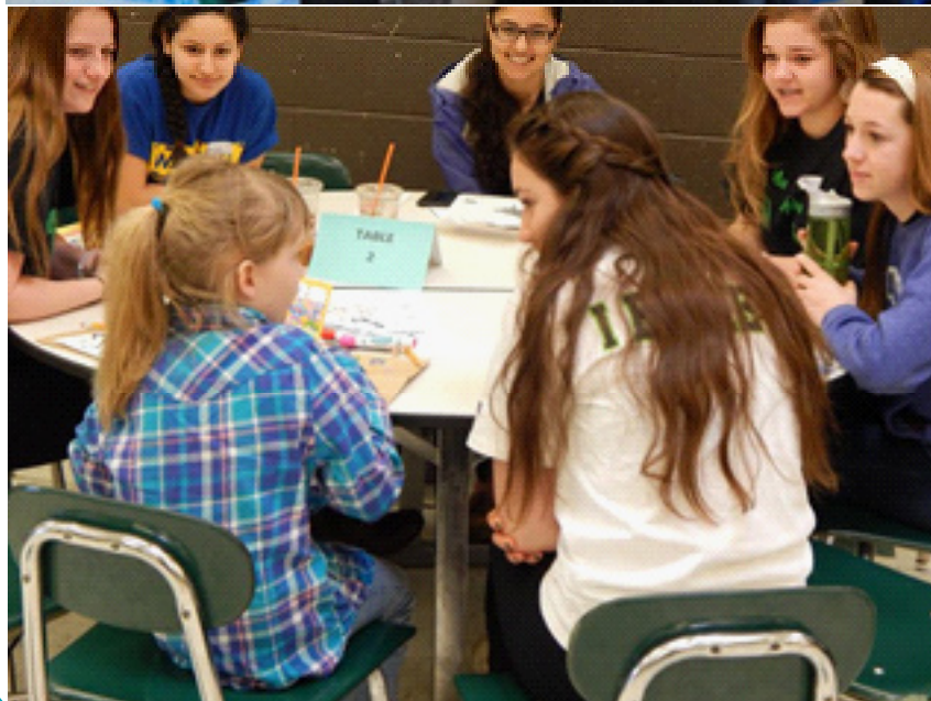
Bottom: Brewster High School Mu Alpha Theta students engaging with the third graders to help solve math problems.