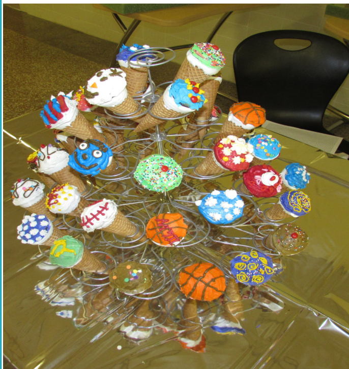
The above picture is from New Mexico Junior College. They partnered with the Community Coalition on Drugs in Lea County for their Pi Day Celebration. The picture is Cone Cakes: Sugar cones with Miniature cupcakes.

Thank you to all those who have shared your activities with us. For full details on these Pi-Day Celebrations, see the online blog section of our website.