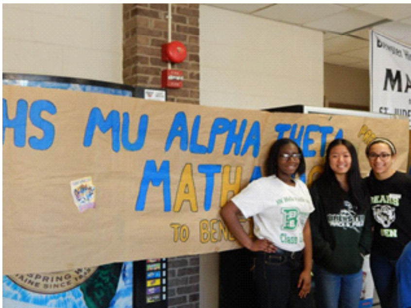
Top: Brewster High School Mu Alpha Theta students welcome the third-graders

Over the past three years, the Mu Alpha Theta has raised over $12,000 for St. Jude's.