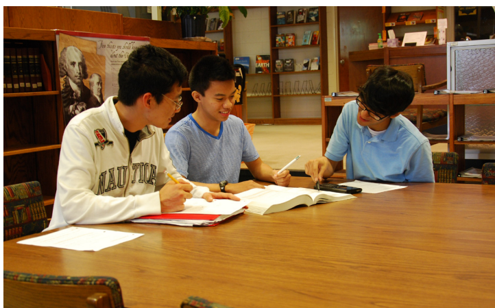
Chapter members tutoring in the media center.

We don't have all the answers, but we are willing to try new ideas and usually good things happen. In 2009, we inducted 80 charter members. Since then, we've maintained about the same numbers, with our latest class having 86 members (57 new inductees). Enthusiasm for the future remains strong. I hope this provides insights to the benefits for establishing a chapter of Mu Alpha Theta. Personally, it is a privilege to work with some of the most talented young adults at Evans High School. They will go on to become significant contributors to our community and our country.